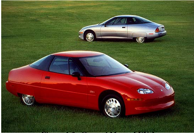
Figure 1-3: General Motors' EV-1

A useful example is the consideration of electric vehicles in the early 1990s. At the time, California and other states were interested in encouraging the adoption of vehicles with no tailpipe emissions in an effort to reduce emissions in urban areas and to gain the associated air quality benefits. Policymakers at the time had a specific term for such vehicles – “zero emissions vehicles (ZEVs)”. The thought was that getting a small but significant chunk of the passenger vehicle fleet to have zero emissions could yield big benefits. Regulations at the time sought to get 2% of new vehicles sold to be ZEVs by 1998. In parallel, manufacturers such as General Motors had been designing and developing the EV-1 and similar cars to meet the mandated demand for the vehicles (see Figure 1-3).